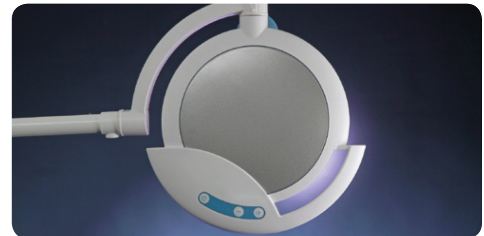
Brightness control via grip and control panel with indicator bars